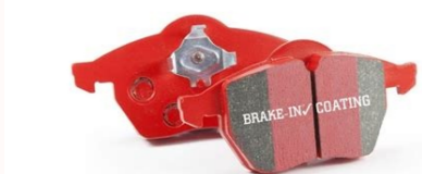
GENERIC IMAGE FOR ILLUSTRATION PURPOSES