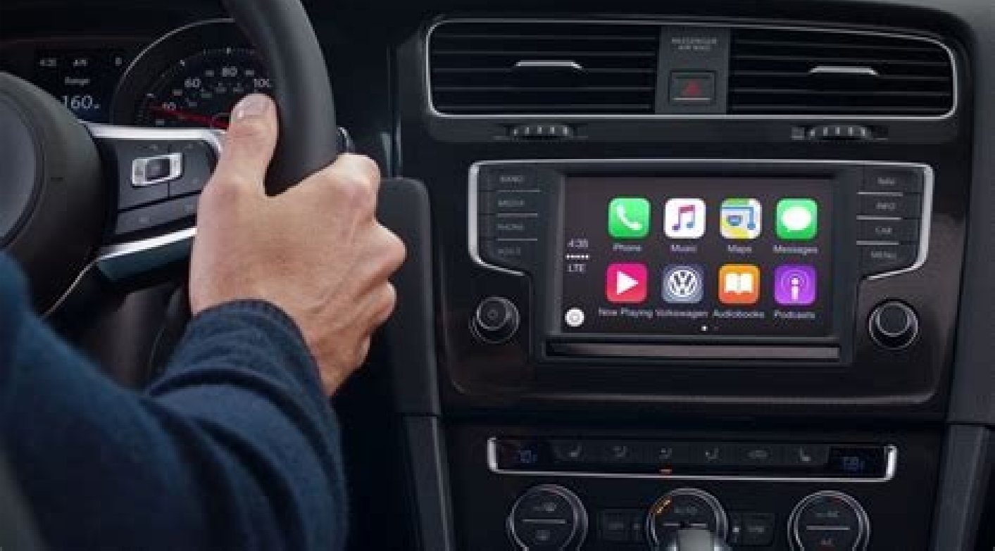
Offline music player for iphone. Best offline music players for iphone. Download and play music offline iphone. Best offline music player app for iphone. Best offline music player for iphone 2021. Play youtube music offline iphone. Iphone offline music player reddit. Offline music player download iphone.