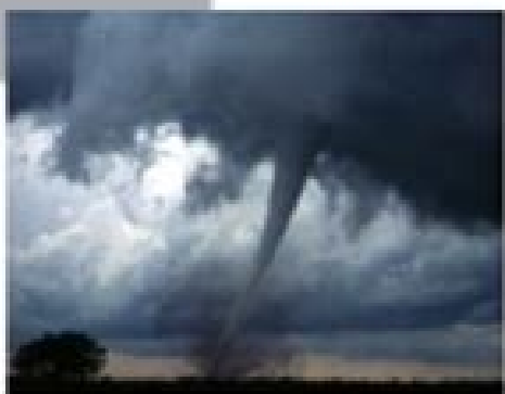
A tornado in Oklahoma